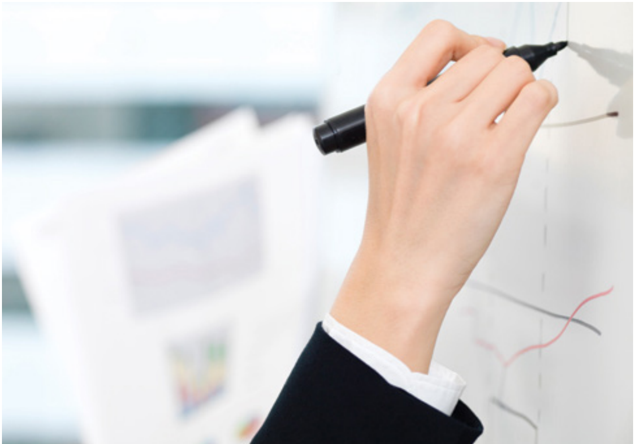
WriteGLASS · WWWG-WHITE