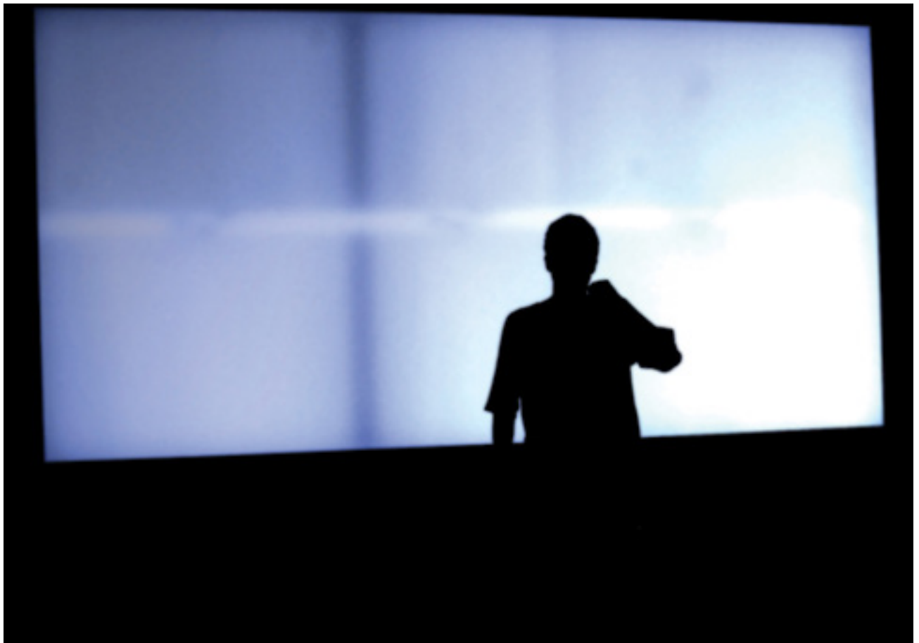
WriteProjection - WWPC-WHITE